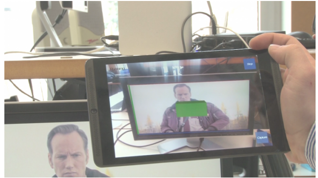
Figure 1: AR annotation on a video streaming on a TV set. The database for the video has a small footprint and is fully contained on the mobile device. Upon registration, an appropriate augmentation is added to the respective screen.

indexing performance and 6DOF trackability of the frames on mobiles. In this demo we show how our system performs on an entire season of a popular TV series, which resembles more than 16 hours of video and an overall amount of 60GB of frame data, compressed into a mobile database of just around 100MB.