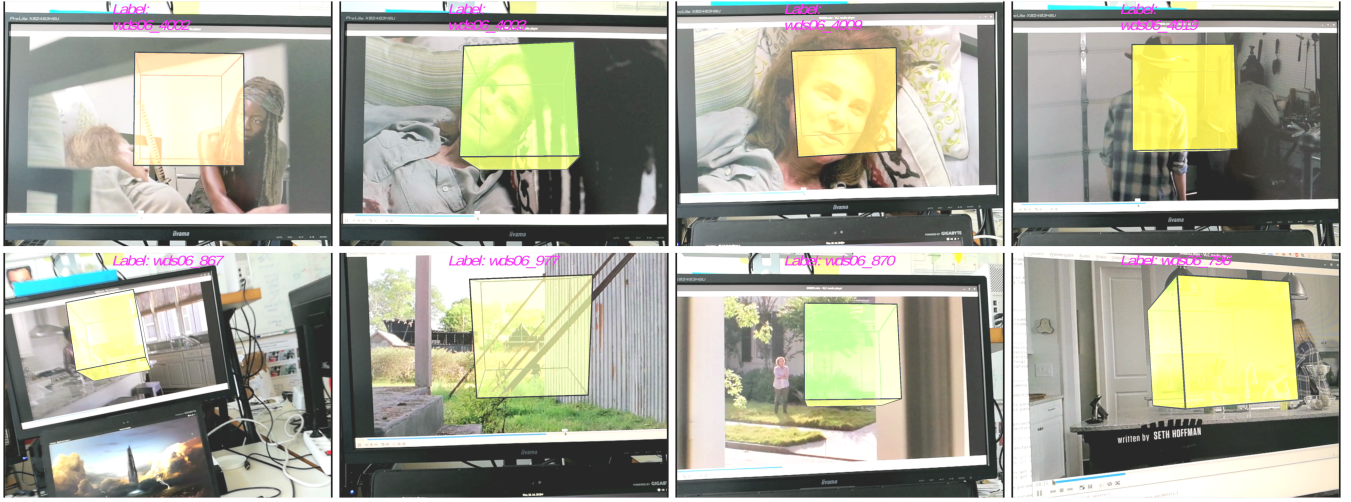
Figure 2: Exemplary screenshots running the recognition and tracking on frames from a 16-hour video of a popular TV series. On the top of each frame, the label of the frame in the database is denoted in pink. The cube is augmented to prove the trackability of the frames.