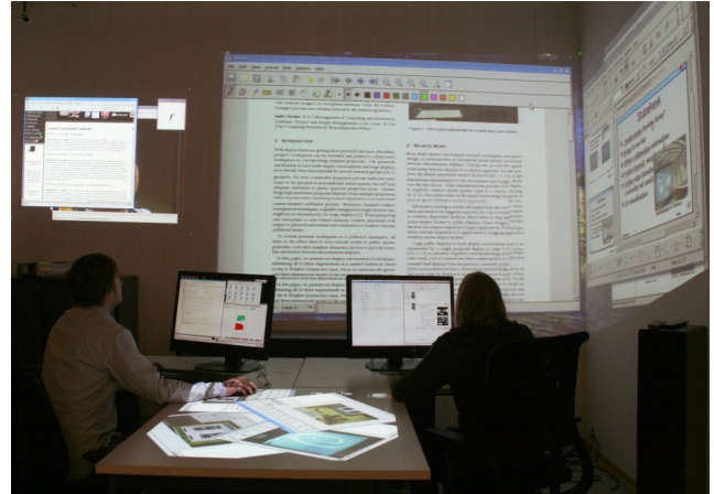
Figure 1: Deskotheque setup with multiple projections and personal workspaces.

vides the foundation for seamless cross-display navigation. Automatic acquisition of a geometric model reduces the need for manual configuration of MDE properties, allows for dynamic reconfiguration, and enables multi-display interaction in tight and irregular office spaces.