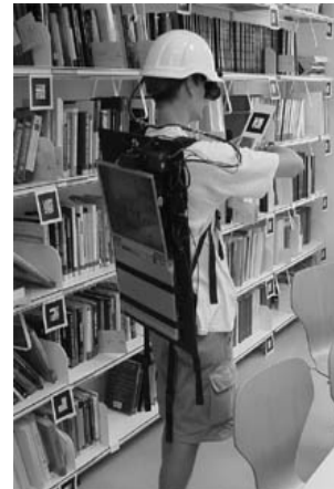
Figure 1. A user at work with the ARLib setup.

Next, text can be input by using either a virtual keyboard or a graffiti pad. The virtual keyboard provides a trustworthy means of input for the user not accommodated to graffiti input (as on a PDA), whereas experienced users will find the graffiti pad handier (see Figure 2.c). The input type can be toggled at any time.