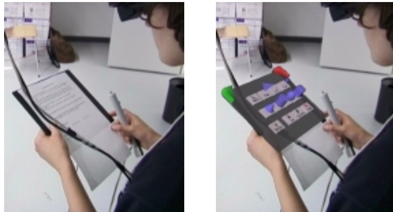
Figure 1: Working with the PIP in augmented reality. By looking out from underneath the head mounted display at the menu panel, the instructions on a sheet of paper can be read (left), by looking through the HMD the menu system with 3D buttons can be seen (right).

We chose to use the Personal Interaction Panel, (Szalavári and Gervautz, 1997), a two-handed 3D interface composed of a position tracked pen and pad to control the application. It allows the straightforward integration of conventional 2D interface elements like buttons, sliders, dials etc. as well as novel 3D interaction widgets. The haptic feedback from the physical props guides the user when interacting with the PIP, while the overlaid graphics allows the props to be used as multi-functional tools. Every application displays its own interface in the form of a PIP „sheet“, which appears on the PIP. The pen and pad are our primary interaction devices. The pen has two buttons, a front – also referred as the primary – button and a back or secondary button. We use both.