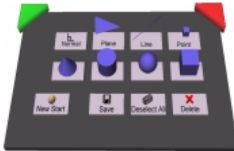
Figure 2: PIP sheet and menu of Construct3D.

The representation of the pen in the virtual world is a small green cylinder with a spherical red end and a conical blue tip as can be seen in Figure 3. Two functions are assigned to the two buttons of the pen and can be activated at any time during the construction process. By clicking the primary button the user places a point at the current position – a point is represented by a small cube instead of a sphere, to keep the number of polygons low for its presentation in the virtual world.