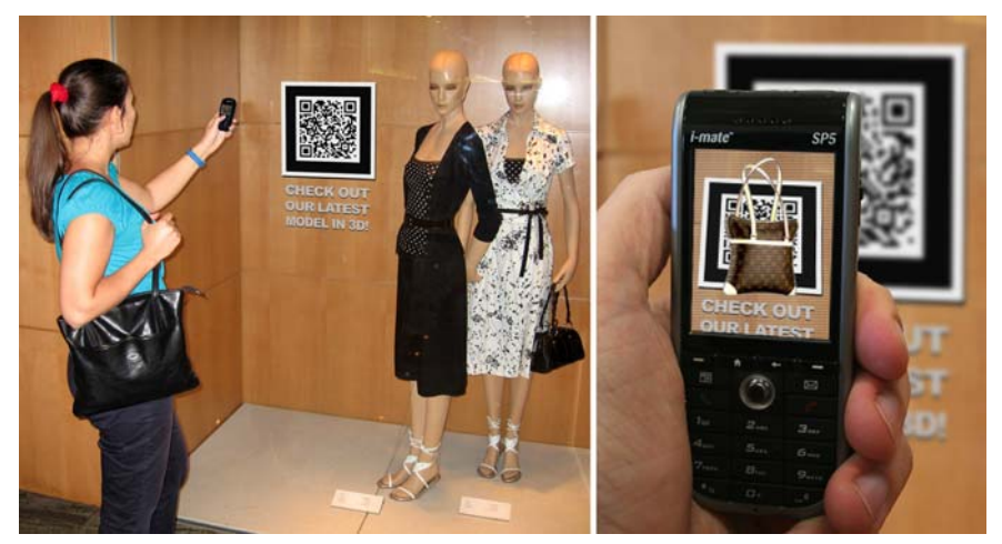
Figure 4: DataMatrix and QR-code

Another approach is the use of 2D barcode markers, such as DataMatrix<sup>11</sup> or QR-Code<sup>12</sup> (see figure 4), which contain enough information to point to a specific web address of an AR content service. This can substitute the need for GPS or image recognition, and directly point to specific content rather than having to know a specific server feed or channel beforehand. It is also a suitable method for non geo-referenced content, for example, for downloading an AR game board game printed and advertised in a newspaper. If barcode markers are used, they can also initialize tracking, and thereby establish a common frame of reference (for a shared space of multiple users), while ongoing tracking can be based on natural features in the surroundings.