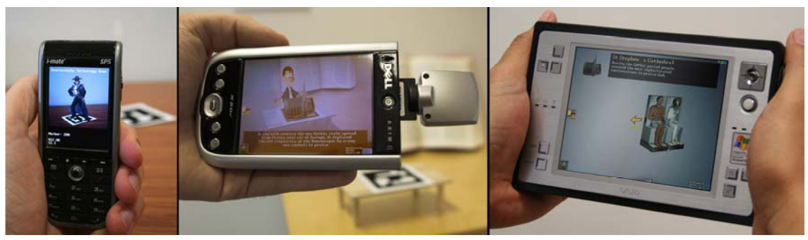
Figure 2: Evolution of Mobile AR Systems

Over the last several years the increasing computing capability of personal mobile devices has made it possible to move AR systems from the backpack mobile AR systems of the mid-nineties to Tablet PCs [New06], PDAs [Wag03] and then mobile phones [Möh04]. Figure 2.0 shows sample systems in this evolution. Most recently applications such as Wikitude [Mob09] can show location tagged AR content on a mobile phone in much the same way as the Touring Machine. Nokia's MARA<sup>5</sup> project is another commercial ready example of the idea shown in the Touring Machine.