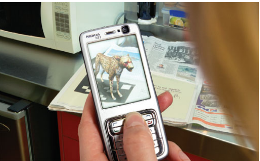
Printed AR Advertisement Virtual Zoo Animal Appearing Figure 5: Wellington Zoo Mobile AR campaign

Although technically the AR application being delivered was very simple, just a single static model, there were challenges in being able to freely distribute a mobile AR advertisement outside of the lab environment. In this case the application was built for Nokia N-series mobile phones running the Symbian operating system, such as the N95, and N72 phones, etc. This meant that code on the application server needed to detect the type of phone that the text message came from. If the phone was not an N-series phone then the AR application would have looked like if the phone could have run it. There were also different versions of the application that needed to be developed depending on the N-series phone model that was being used. If the text message was sent from a Nokia phone then there was a specific executable sent to the mobile phone depending on the model of phone it was.