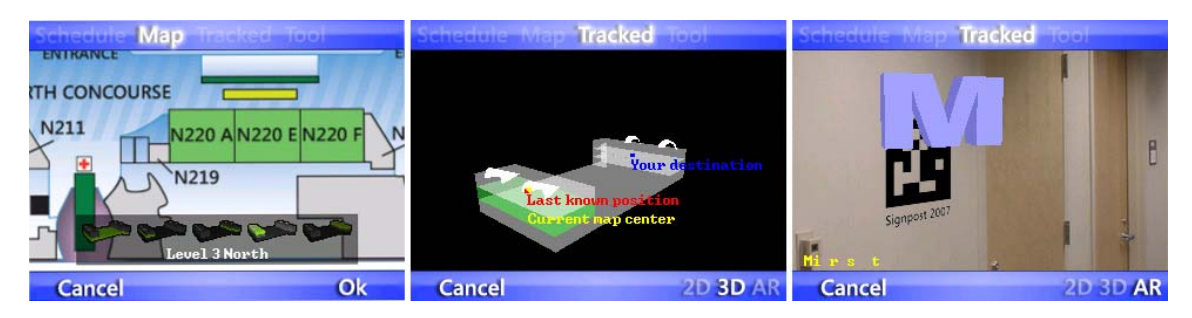
Fig 8. Left: Switching between maps; Middle: 3D view of the building with the current user's location; Right: built-in Augmented Reality mini-game.

For large events in venues with multiple levels or buildings, a single map is no longer sufficient. Signpost therefore supports multiple maps linked to a 3D overview, or alternatively an interactive 3D representation of the building showing the global geographic relationship of the current location and the target location (Fig ).