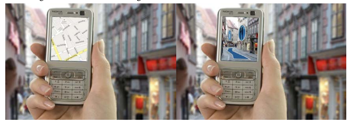
Figure 1: Contrary to traditional map displays (left), AR 2.0 will navigation information on top of the images captured by mobile phones (right). Users will also be able to create and update 3D registered content, creating a location-based social network.

In a similar way, the goal of AR 2.0 is to provide widely deployable location based AR experiences that enhance creativity, collaboration, communications, and information sharing, and are based on user generated content. With an AR 2.0 platform a user should be able to move through the real world and see virtual overlays of related information appearing at locations of interest. Figure 1.0 shows how this might look.