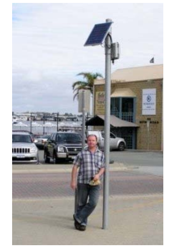
Figure 6: InfoPoint Hardware

The system was tested over several months during which the InfoPoint detected an average of 600 distinct phones each day. The installation highlighted issues related to long-term real-world deployments. Only around 5% of users accepted the offer to receive the digital content, showing a reluctance on the part of users to download unsolicited content. There were also major variations found in Bluetooth interfaces between mobile phone models, and wide variations in familiarity with Bluetooth-based interaction, with a strong generational bias.