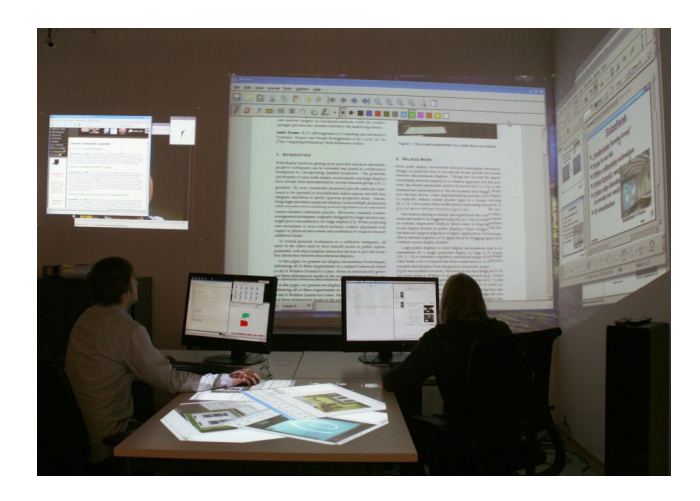
Figure 1: Deskotheque setup with multiple projections and personal workspaces.

IEEE Virtual Reality 2009 14-18 March, Lafayette, Louisiana, USA 978-1-4244-3943-0/09/$25.00 ©2009 IEEE