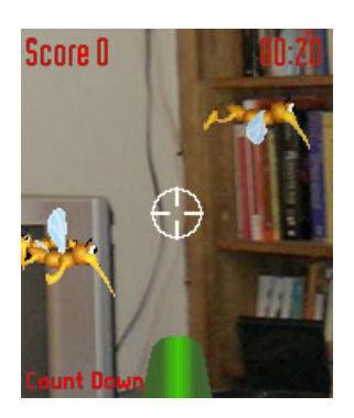
Figure 4. Mosquito Hunt on the Siemens SX-1.

One of the first AR-like applications on a mobile phone was the Mosquito Hunt game (see Figure 4) on the Siemens SX-1 phone in 2003. It used optical flow detection to estimate the movement of the rotational mobile phone and let the user aim and shot at virtual mosquitoes. The AR soccer game [3] used a similar approach to detect movements of the player's foot trying to shot a virtual ball into a virtual goal.