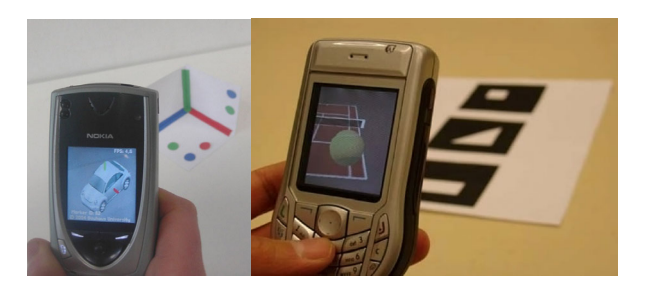
Figure 2: Left: 3D markers by Möhring. Right: AR-Tennis by Henrysson.

Naturally, first inroads in tracking on mobile devices themselves focused on fiducial marker tracking, which is less computationally demanding than approaches based on natural features. Nevertheless, only few solutions for mobile phones have been reported in literature. In 2003 Wagner et. al ported ARToolKit to Windows CE and thus created the first self-contained AR application [15] on an off-the-shelf embedded device. This port later evolved into the ARToolKitPlus library [16].