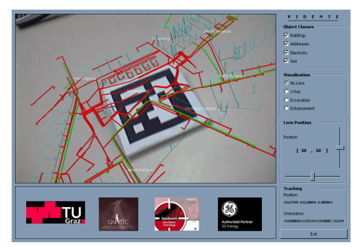
Figure 4: A Qt GUI controlling an Open Inventor application using Thekla

A recent extension to Muddleware allows the generation of graphical user interfaces using Qt Designer<sup>4</sup> without any programming. Thekla automatically pushes the state of all Qt widgets to the Muddleware server, which forwards the state to the application(s) via a Watchdog notification.