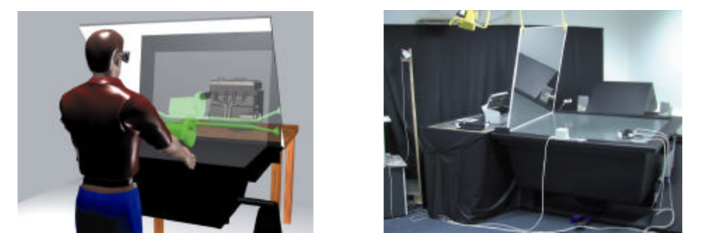
Figure 3: A hybrid assembly scenario (right) with the extended virtual table (left).

Switching between the immersive virtual environment and the augmented real environment is handled on a gazedirected basis (i.e. whether the user is looking at the Virtual Table, or through the mirror at the real workbench).