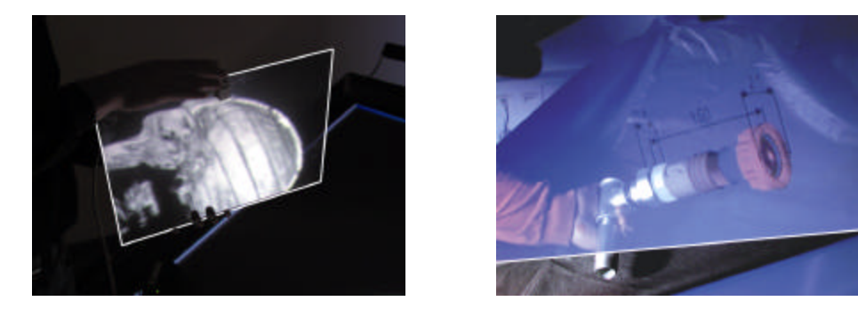
Figure 2: The transflective pad used in an opaque mode (left) to observe CT-based volume data, and in a seethrough mode (right) to superimpose a real object.

Two fundamental problems of semi-immersive rear-projection devices are the limited viewing that is caused by relatively small projection planes, and their inability to combine real objects with displayed virtual ones. This is due to the fact that real objects always occlude the projection planes and consequently the displayed virtual environment, thus prohibiting traditional augmented reality tasks from being supported by such devices. To overcome both problems, we developed the transflective pad –a hand-held half-silvered mirror that, on the one hand, allows a user to interactively increase the limited viewing volume [2] and, on the other hand, enables rear-projection devices to support basic augmented reality tasks [3].