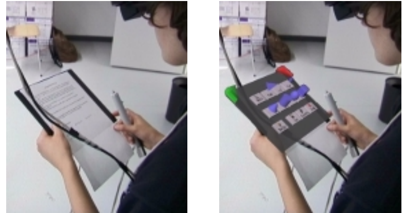
Figure 1: Working with the PIP in augmented reality. By looking out from underneath the head mounted display at the menu panel, the instructions on a sheet of paper can be read (left), by looking through the HMD the menu system with 3D buttons can be seen (right).

We chose to use the Personal Interaction Panel, (Szalavári and Gervautz, 1997), a two-handed 3D interface composed of a position tracked pen and pad to control the application. It allows the straightforward integration of conventional 2D interface elements like buttons, sliders, dials etc. as well as novel 3D interaction widgets. The haptic feedback from the physical props guides the user when interacting with the PIP, while the overlaid graphics allows the props to be used as multi-functional tools. Every application displays its own interface in the form of a PIP "sheet", which appears on the PIP. The pen and pad are our primary interaction devices. The pen has two buttons, a front – also referred as the primary – button and a back or secondary button. We use both.