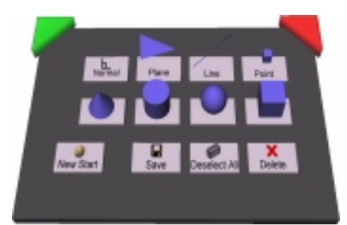
Figure 2: PIP sheet and menu of Construct3D.

The representation of the pen in the virtual world is a small green cylinder with a spherical red end and a conical blue tip as can be seen in Figure 3. Two functions are assigned to the two buttons of the pen and can be activated at any time during the construction process. By clicking the primary button the user places a point at the current position – a point is represented by a small cube instead of a sphere, to keep the number of polygons low for its presentation in the virtual world.