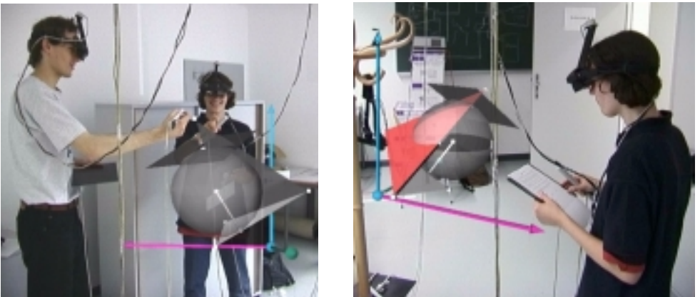
Figure 4: Working in Construct3D. The tutor assists the student while working on the model. (Image composition)

The coordinates of all points are given. Because of inaccuracies with measuring positions in our virtual world (caused by tracker hardware), a tolerance of 2 centimeters per coordinate is acceptable. The result can be seen in figure 4.